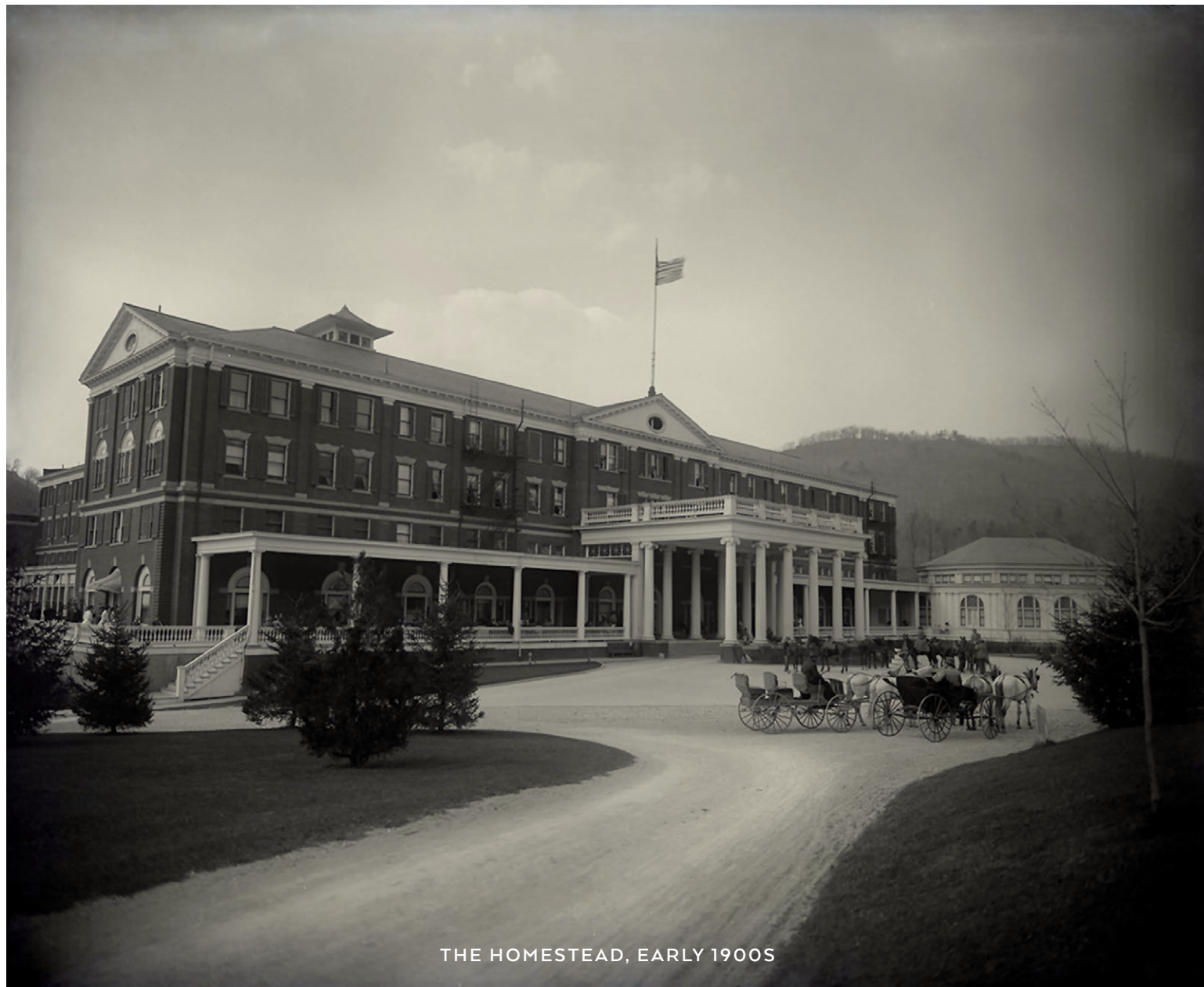
THE HOMESTEAD, EARLY 1900S