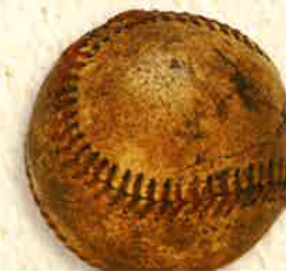
The first professional baseball game was played in

*CONSUMING RAW OR UNDERCOOKED MEATS / POULTRY / SEAFOOD SHELLFISH OR EGGS MAY INCREASE YOUR RISK OF FOODBORNE ILLNESS. PLEASE NOTIFY US OF ANY FOOD ALLERGY.