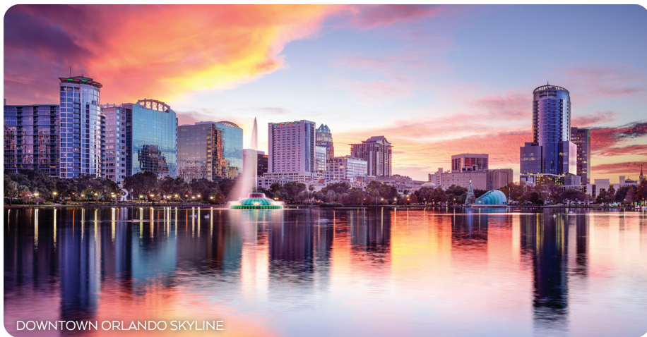
DOWNTOWN ORLANDO SKYLINE

OMNI ORLANDO RESORT AT CHAMPIONSGATE 1500 MASTERS BOULEVARD CHAMPIONSGATE, FLORIDA 33896 407-238-6526 OMNIHOTELS.COM/ORLANDO