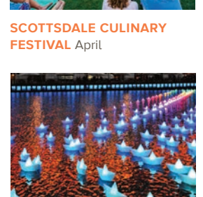
*CANAL CONVERGENCE November